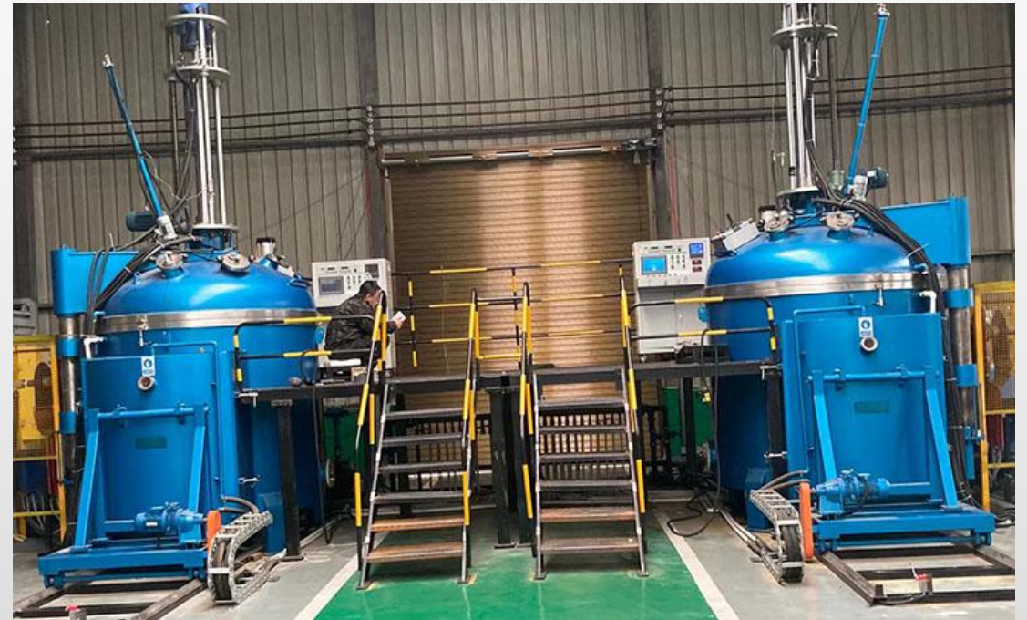
Our equipment to produce alloys

We also can do alloys of MgNd, MgMn, MgCa, MgEr, MgCe, MgSm, MgNi, MgYnd, MgLa, MgLaCe, MgDy, MgSr, MgSi, MgLi, MgSn, MgBa, MgCu and so on. OEM service is available. Please contact us for more details.Thanks.