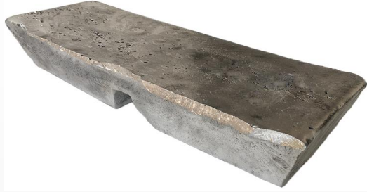
Magnesium Yttrium Alloy