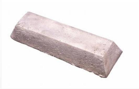
Aluminum Lanthanum Cerium Alloy