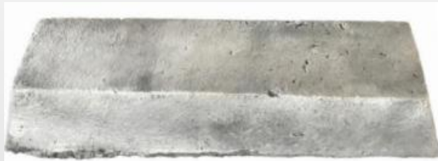
Aluminum Cobalt Alloy