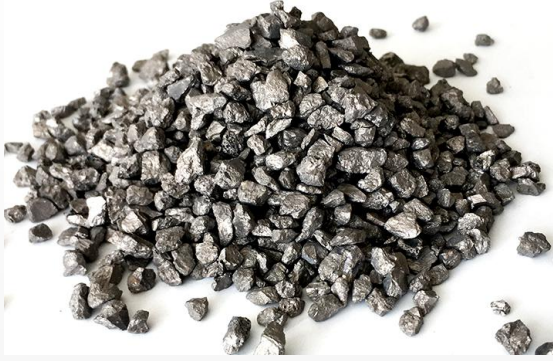
Aluminium Yttrium Alloy