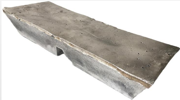
Magnesium Gadolinium Alloy