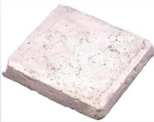
Aluminum Erbium Alloy