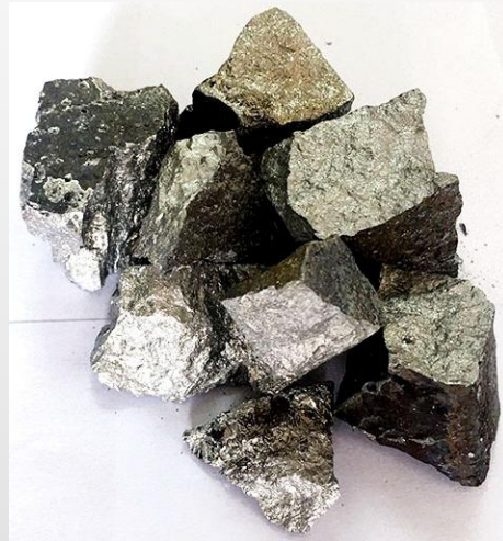
Magnesium Nickel Alloy

We also can do alloys of MgNd, MgMn, MgCa, MgEr, MgCe, MgSm, MgNi, MgYnd, MgLa, MgLaCe, MgDy, MgSr, MgSi, MgLi, MgSn, MgBa, MgCu and so on. OEM service is available. Please contact us for more details.Thanks.